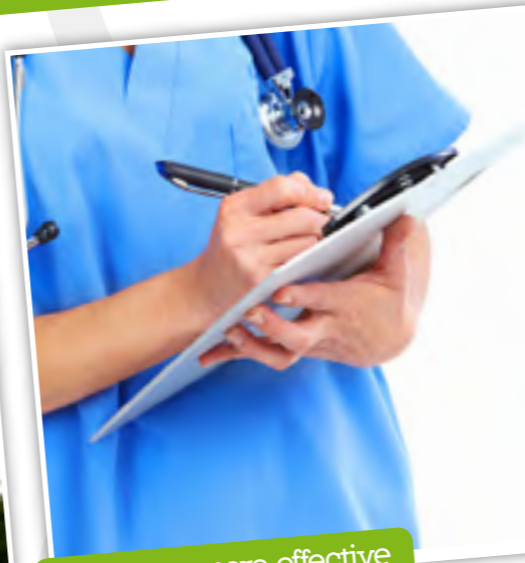
Creating a more effective healthcare system