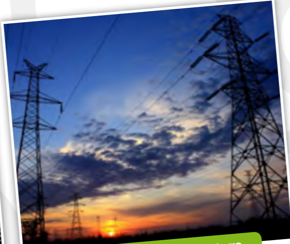
Bridging the gap in infrastructure development: power and transport