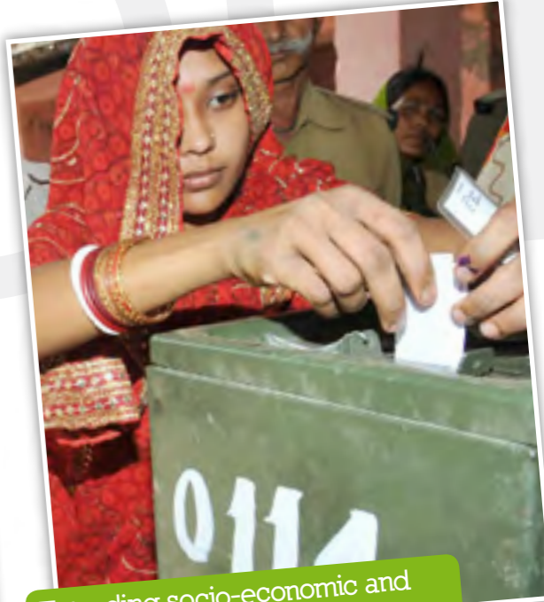
Extending socio-economic and political roles of women