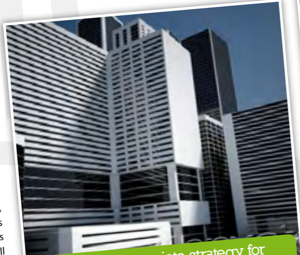
Devising an appropriate strategy for industrialization and urban development

Success of any development strategy depends on a serious engagement among all stakeholders in order to identify issues, and prioritise and develop strategies for action. The strengths of the state need to be maximised while focussing on strategies to overcome the bottlenecks, forging partnerships with all stakeholders and benefiting from technical know-how, ideas and experiences form critical ingredients for successful implementation of development strategies.