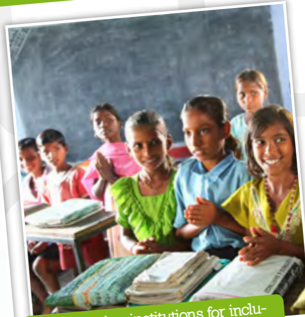
Strengthening institutions for inclusive and equitable development