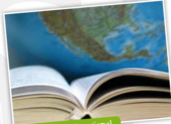
Strengthening educational and training institutions