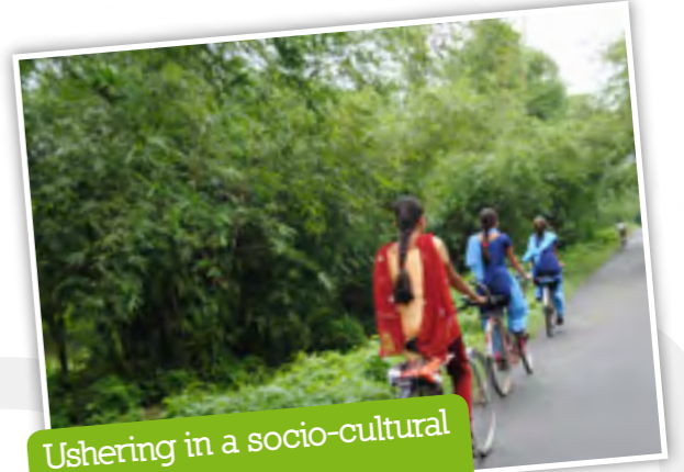
Ushering in a socio-cultural renaissance