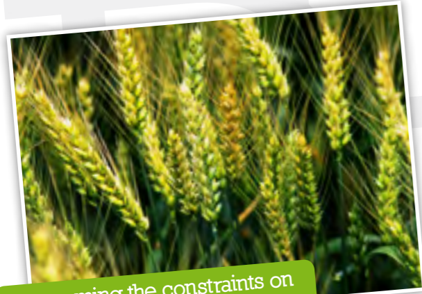
Overcoming the constraints on faster agricultural growth